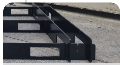
FORK POCKETS FOR SAFE LOADING AND UNLOADING

CONCRETE - ASPHALT - DEMOLITION - TIMBER - PLASTIC - SPECIALIST MATERIALS