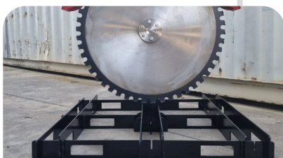
STAND FOR EASY ATTACHING AND DETACHING