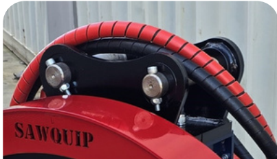
CUSTOM HITCH OPTIONS AVAILABLE