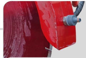
HOSE FITTING FOR WATER COOLING