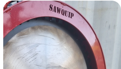
STURDY GUARD PROTECTION