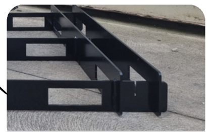
FORK POCKETS FOR SAFE LOADING AND UNLOADING