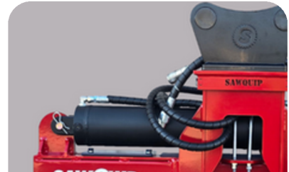
HYDRAULIC RAM PROTECTED FROM SPLITTING ACTION