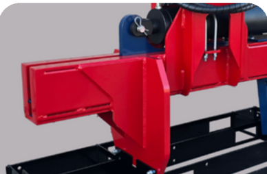
STRENGTHENED SPLITTING PLATE