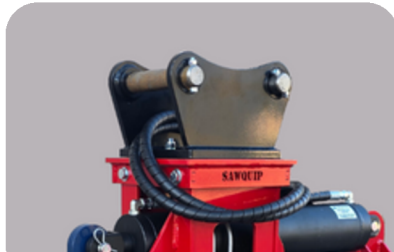
HITCH AND HOSES TO SUIT MACHINE