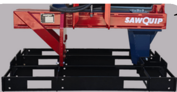
STAND FOR EASY STORAGE