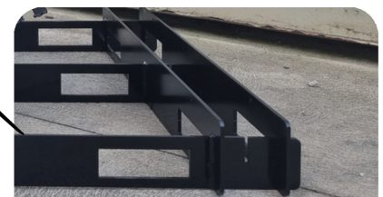
FORK POCKETS FOR SAFE LOADING AND UNLOADING