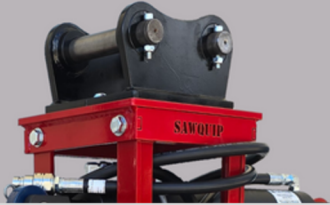
HITCH AND HOSES TO SUIT MACHINE