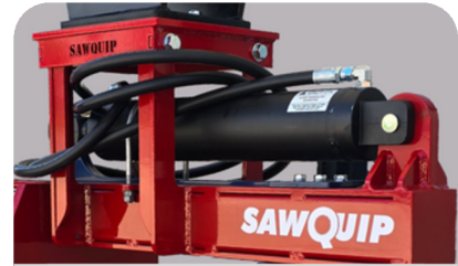
HYDRAULIC RAM PROTECTED FROM SPLITTING ACTION